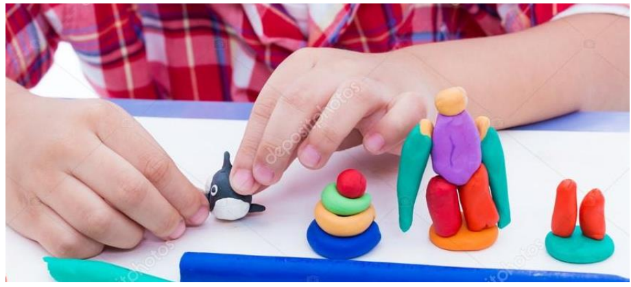
God's Playdoh (Romans 12:4-8)

Just as each of us has one body with many members, and these members do not all have the same function, so in Christ we, who are many, form one body, and each member belongs to all the others. We have different gifts, according to the grace given us...(v. 4-6)